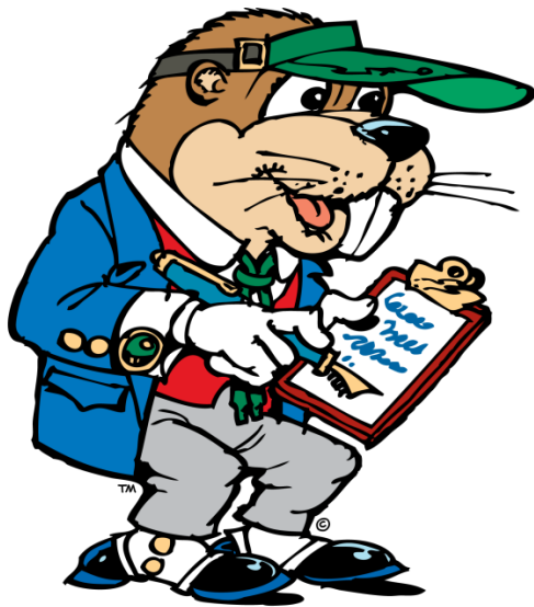
Chester B. Gopher

A Worksheet and Guide to Compute Your Net Worth